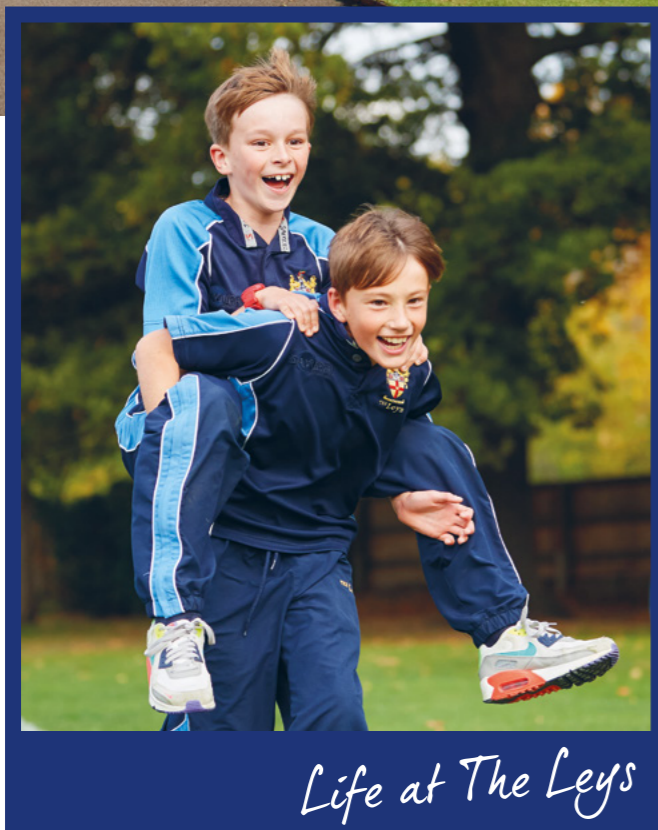
Life at The Leys