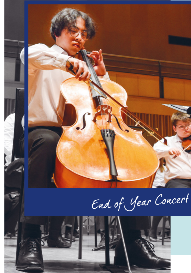
End of Year Concert