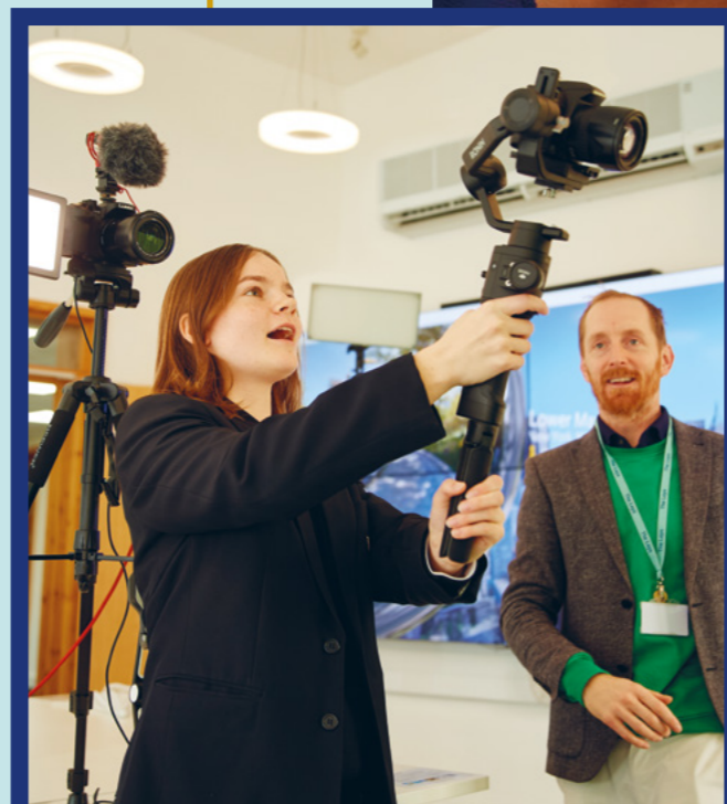
The Vision Studio