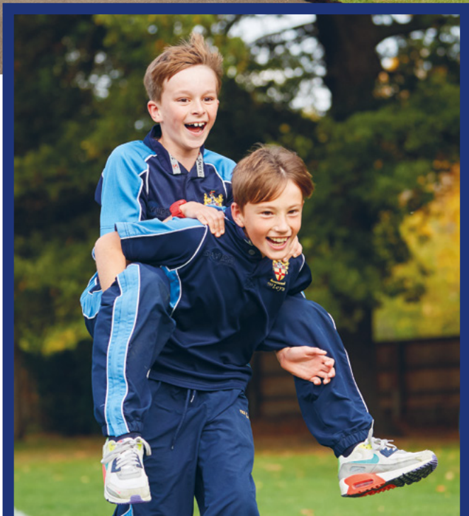
Life at The Leys

The Leys is a co-educational boarding and day school for pupils aged between 11 and 18. Set in the heart of the beautiful and stimulating city of Cambridge, one of the world's leading cultural and academic centres, The Leys' unique location allows pupils unrivalled access to the vast array of cultural and educational opportunities that Cambridge has to offer.